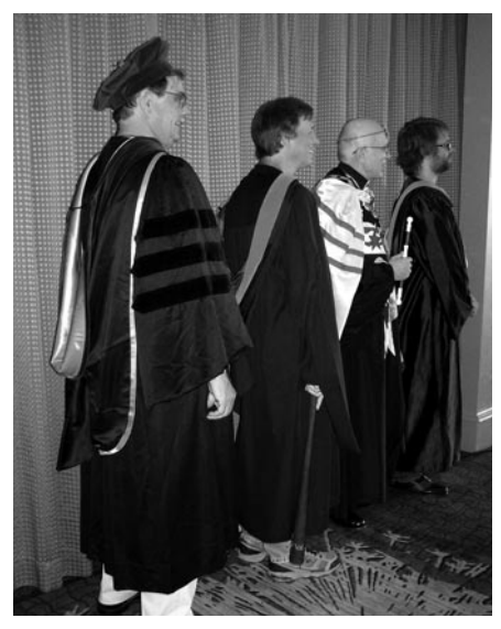
Attendees in academic garb ready for the Opening Procession (or possibly waiting for their Golfimbul medals)